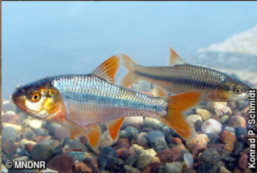
Konrad P. Schmidt

The proposed Little Rock River complex, consisting of 293 acres protected under new conservation easements, contains native prairie on multiple parcels and a portion of the Little Rock River. The Little Rock River is important habitat for the Topeka Shiner, listed as a federally endangered species by the USFWS. Protection of the Little Rock River parcels, along with adjacent state lands, creates a complex of approximately 620 acres that will provide critical habitat for the Topeka Shiner and other Species in Greatest Conservation Need found in the area.