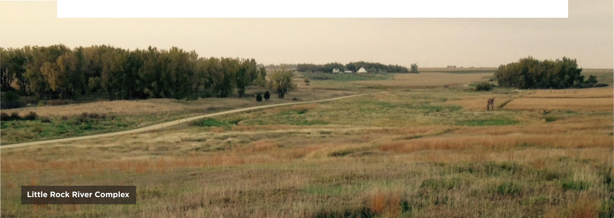
Little Rock River Complex