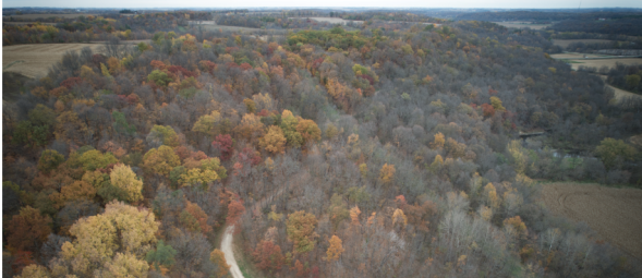
Fee Acquisition: Moon Farms 420 acres — Expected to close September, 2022