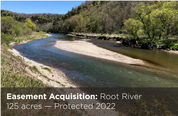
Easement Acquisition: Root River 125 acres — Protected 2022