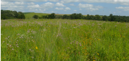
Restoration / Enhancement: 7 Springs WMA — 94 acres — Seeded 2015 & 2016, Burns 2021 & 2022