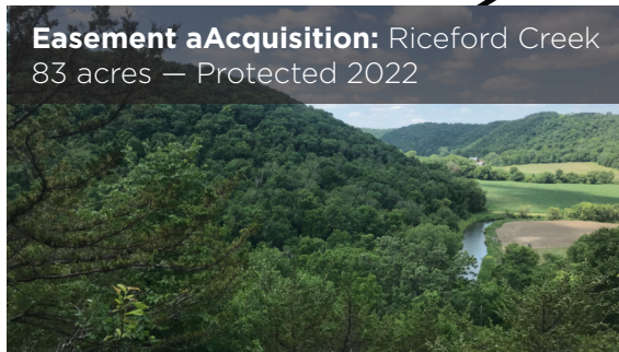
Easement Acquisition: Riceford Creek 83 acres — Protected 2022