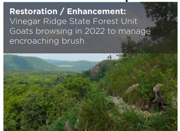
Restoration / Enhancement: Vinegar Ridge State Forest Unit Goats browsing in 2022 to manage encroaching brush