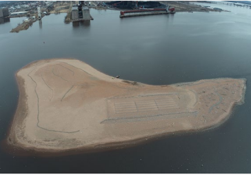
Restoring Common Tern habitat at Interstate Island