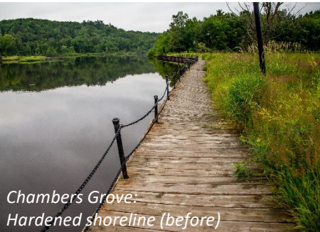
Chambers Grove: Hardened shoreline (before)

Native Brook Trout in restored Knowlton Creek A Muskie 'hot spot' at Radio Tower Bay Spawning Lake Sturgeon at Chambers Grove