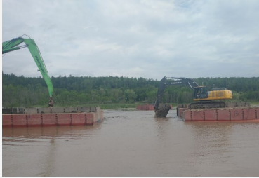
Restoring fish habitat at Perch Lake