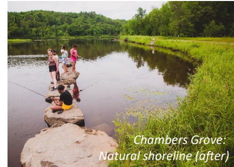
Chambers Grove: Natural shoreline (after)

Native Brook Trout in restored Knowlton Creek A Muskie 'hot spot' at Radio Tower Bay Spawning Lake Sturgeon at Chambers Grove