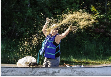
Seeding manoomin in restored coastal marsh at Kingsbury Bay