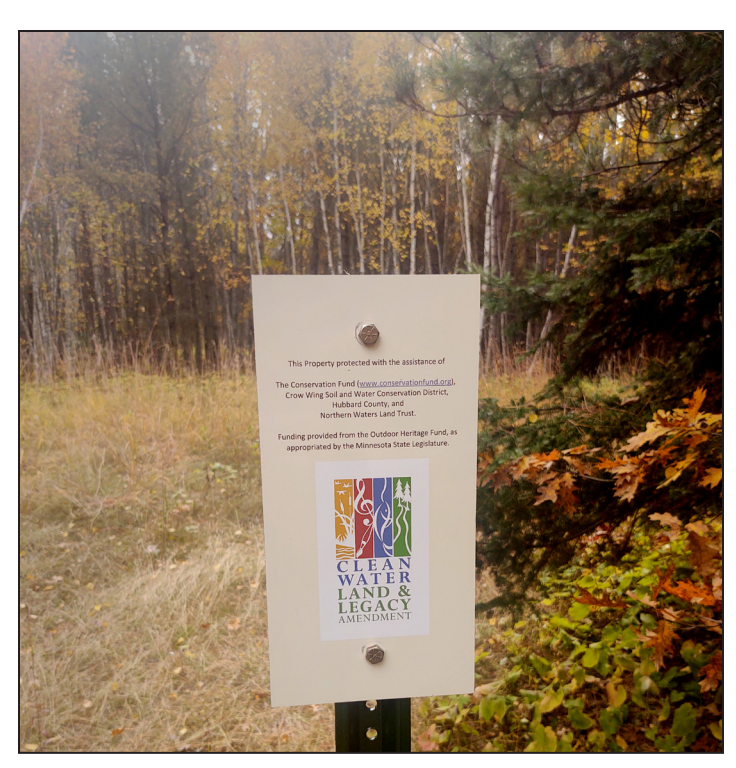
A Clean Water Land & Legacy Amendment sign marks property south of Akeley in Hubbard County that is now owned by the county.

A second grant-funded land purchase in Hubbard County — encompassing parcels